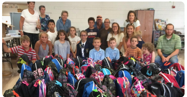
Stuffing Backpacks for Hyannis West Elementary

Keep your eyes open for school supply sales! Once again, we will be collecting school supplies for the children of Hyannis West. Backpacks are provided by Rotary and other groups, so we just need to fill them! Look for the collection box in early August. The youth group and Sunday School will stuff the backpacks on Tuesday, August 29, in the late afternoon. More details coming soon!