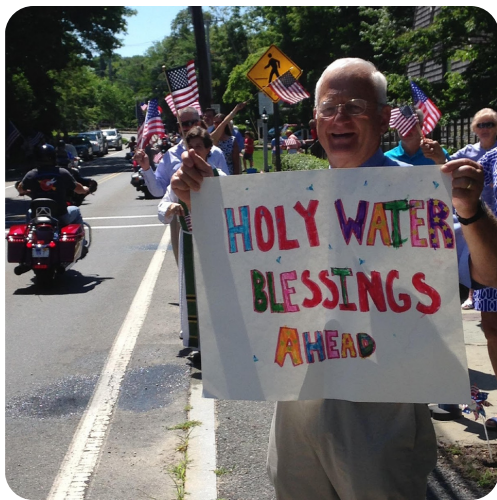
Big Nick's Ride for the Fallen

Please come to the Saturday 5:00 pm service or Sunday morning at 8:00 am. ALL ARE WELCOME to come at 10 am to hold signs and cheer on the riders while our clergy offer holy water blessings. This is a unique and fun experience for all!