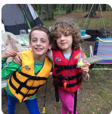
Flat Jesus went camping at Nickerson State Park