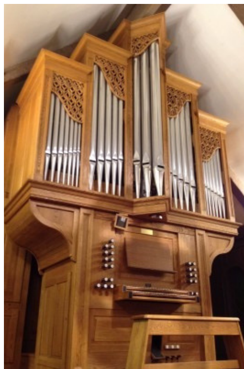
St. Mary's Organ