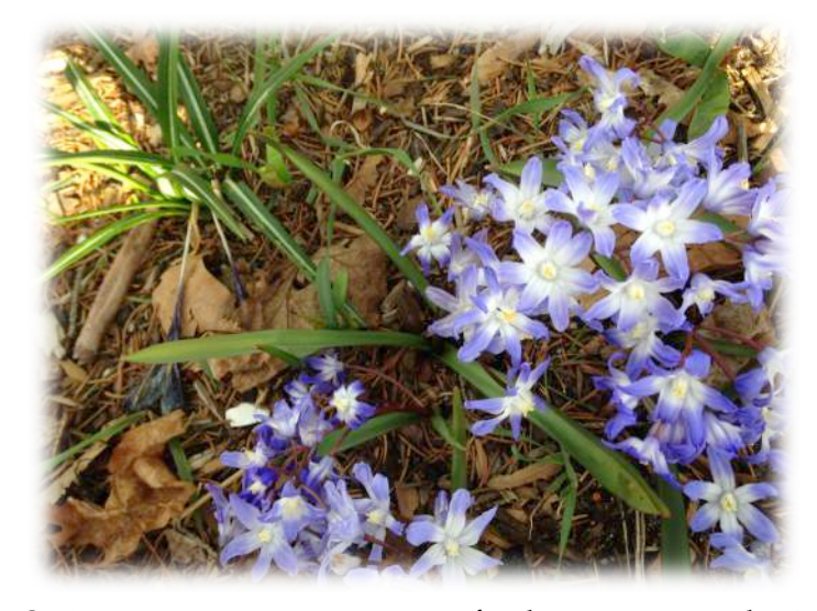
Spring, you cannot come too soon for these weary travelers!

Thank for your support of our coffee ministry.