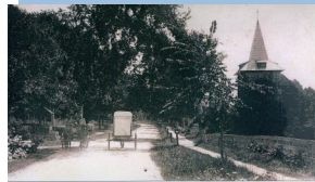
At right, St. Mary's Church, constructed in 1891. At left, the same group. The photograph here captured another 1900s version of St. Mary's Church, Barnstable.

searchstmarysrector@gmail.com www.stmarys-church.org